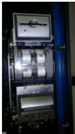
Accessing the banknote path in the chassis and cassettes:

Accessing the banknote path in the validating head: If you need to remove the validating head from the housing, lift the latch at the bottom of the validating head. Gently remove the validating head from the housing.