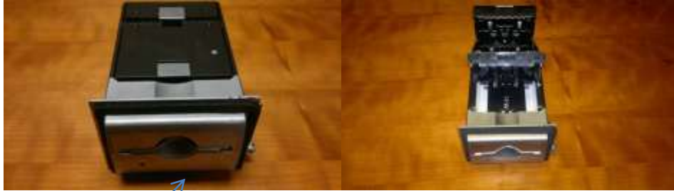
Accessing the banknote path on the validating head

Unlock and open the service door of the Pay Station. Access the respective part of the Cashcode MFL or Bill-to-Bill reader.