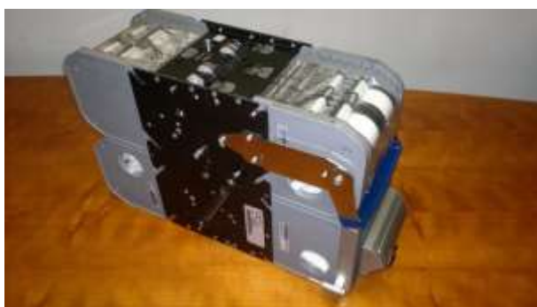
Opening the chassis and accessing the path switch

Take hold of the handle on the front of the chassis and pull out the chassis and contents horizontally. Set the chassis and cassettes down on a suitable surface.