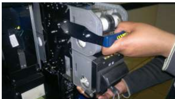
Removing the chassis from the housing.

The recycling cassettes, the dispensing cassette and the path switch are mounted in a chassis. In order to access the banknote path, you must remove the entire chassis from the housing of the CashCode Bill-to-Bill.